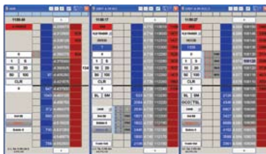
↑ Autospreader® with Dynamic Settings Window and Treasury prices with yield AVAILABLE WITH X_TRADER® Pro